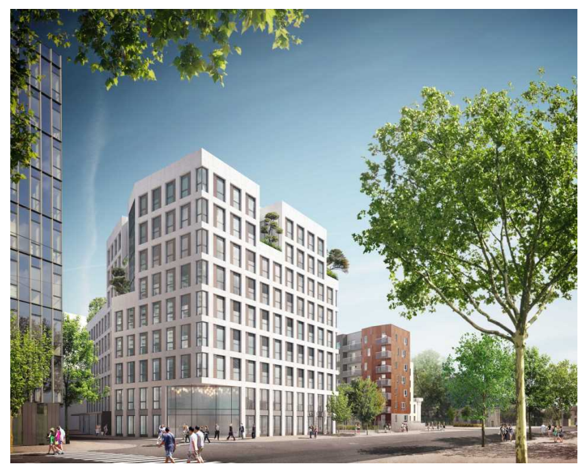
KARRE (Lyon 69)

On July 20, Icade and BNP PARIBAS DIVERSIPIERRE, a real-estate collective investment scheme (General public OPCI) managed by BNP PARIBAS REIM France, signed a preliminary off-plan lease agreement for the KARRE office building located at the heart of the Carré de Soie multimodal hub (Grand Lyon). The building was designed by the Jean de Gastine firm (Paris) and has an office floor area of 9,800 sq.m and 113 parking spaces.