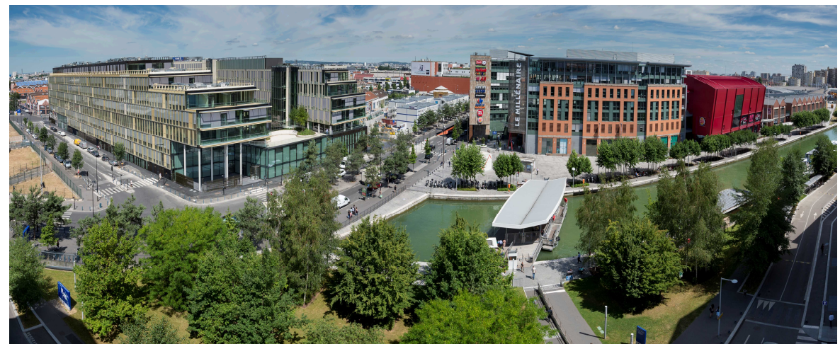
Veolia's headquarters (Aubervilliers 93)

It is subject to a 9-year lease that started on the date of completion. The project owner was assisted in project management duties by Icade Promotion.