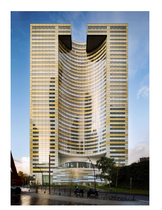
EQHO Tower (La Défense, 92)

Icade agreed to lease an additional 4,321 sq.m to one of its tenants, resulting in a financial occupancy rate of 96% in the EQHO Tower.